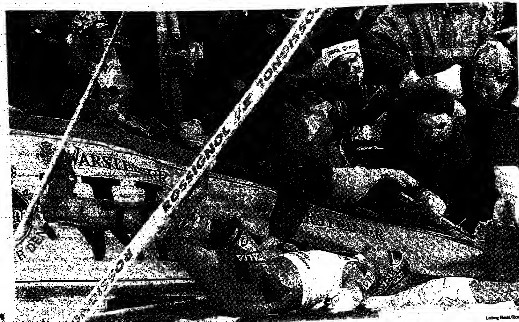
Alberto Tomba's supporters didn't let a barrier stop them from congratulating the Italian skier, who fell backward while celebrating Sunday's slalom victory.